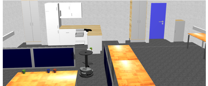
Figure 1. Evaluation scenario. The robot moves cups from the table to the dishwasher, when the doorbell rings. It should then answer the door.

For this purpose, we define a new transition relation TTrans for task operations (adding, removing, switching) on top of