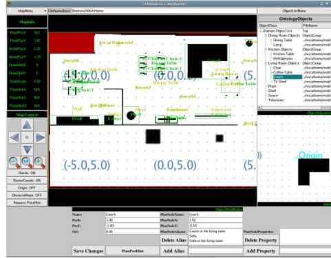
(a) map building tool